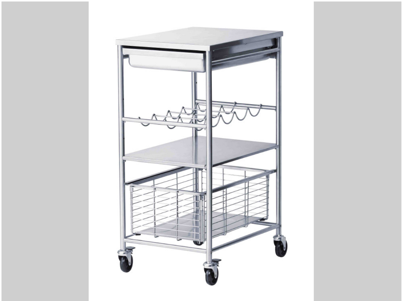
IKEA's Grundtal kitchen cart, $149.

Sturdy, with faux wood and aluminium construction, it's built to withstand the elements and the bumpiest of backyards. Find it for $499 at CrateandBarrel.ca ( http://www.crateandbarrel.ca/ ).