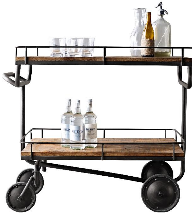
Rustic iron cart paired with wide-plank wood shelves, $749 at restorationhardware.com.

Industrial chic: If you live in a loft with a hint of industrial history, this is the one for you. A cross between a shopping trolley and a factory cart, the rustic iron is paired with wide-plank wood shelves and blessed with rails to prevent your bottles from rolling off. Find it for $749 at restorationhardware.com ( http://www.restorationhardware.com/ ).