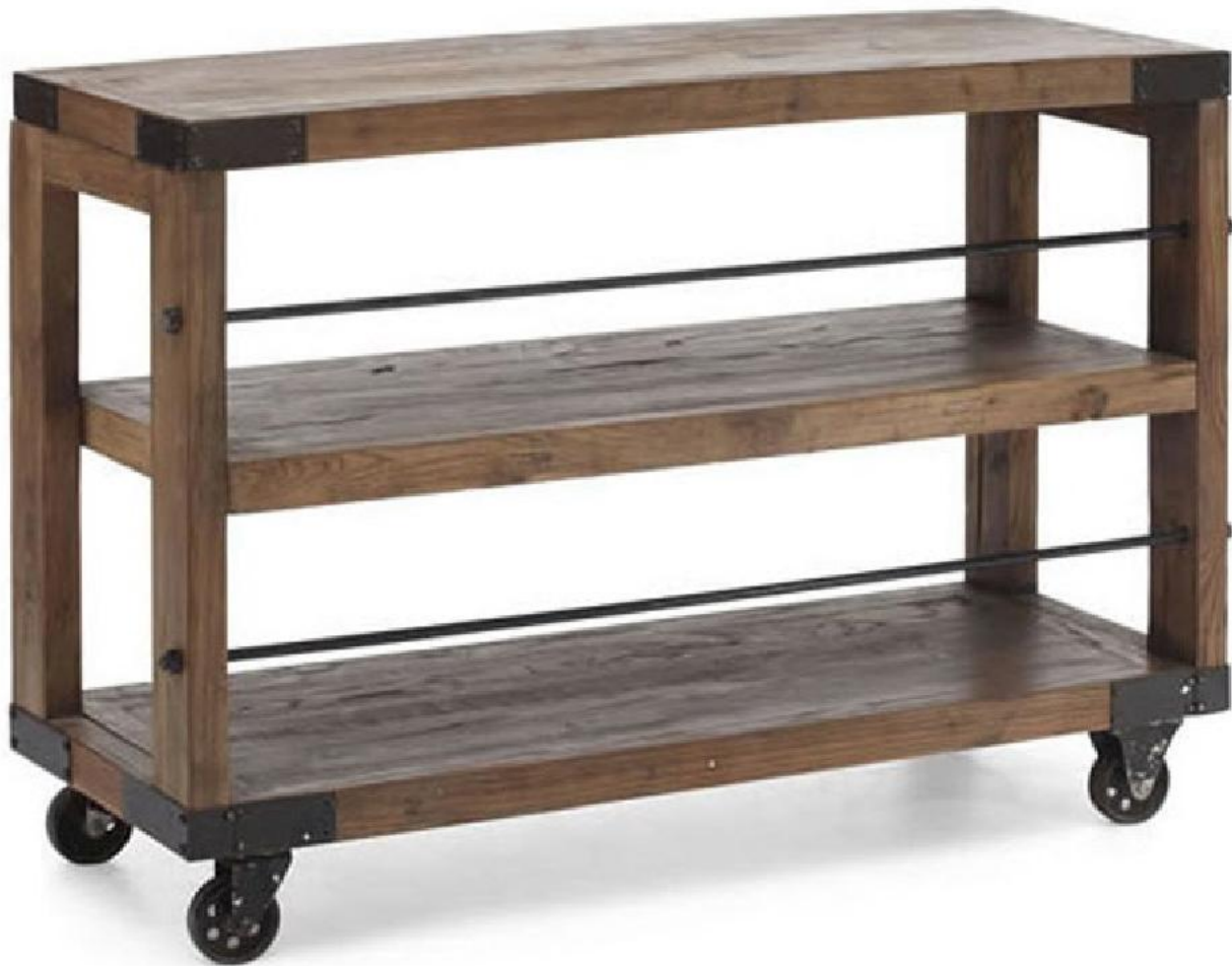
Mason cart at Zone, $595.

Double duty: Technically, the Mason cart can be used as a rolling shelf if you need to move books around your library. But it will be far more fun to use it as a bar. The metal cables were added just to prevent bottles from rolling off. Made from solid elm and metal, it's got the look of longevity and is $595 at Zone, 471 Sussex Dr.