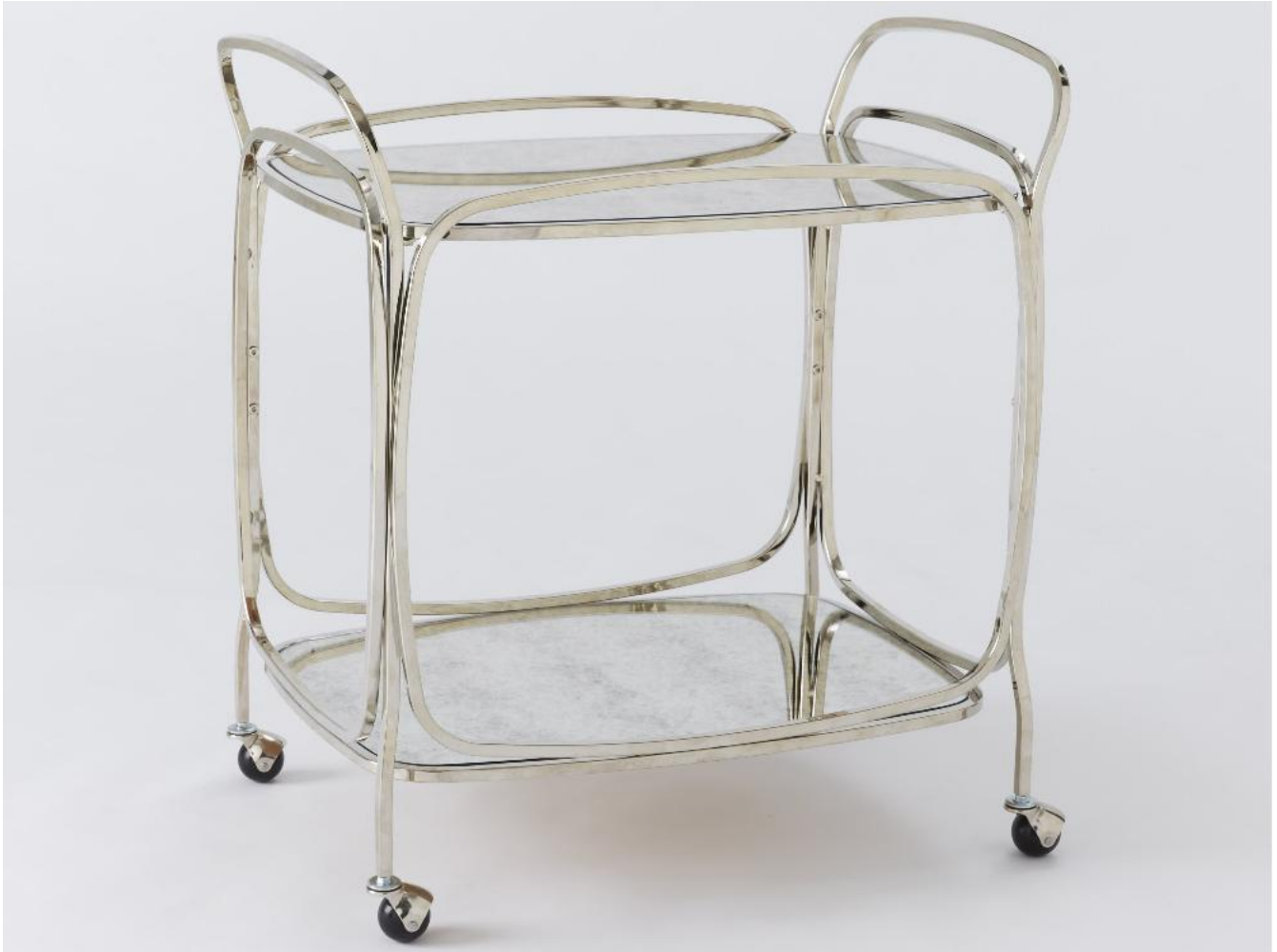
Polished nickel and mirror trolley from West Elm, $479.

Cocktails are served: There's no getting away from the Art Deco-inspired glamour of this trolley. Park it by the pool to glitter in the sun, put on a pair of shades and start serving those martini cocktails. When you're done, roll this polished nickel and mirror beauty back inside where it would be perfect as extra shelving in a classic white marble bathroom. It's $479 at West Elm (http://www.westelm.com/) , or through their Toronto or Montreal stores.