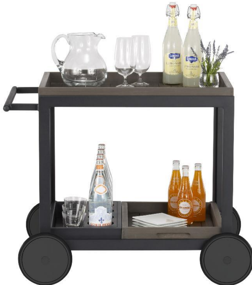
Alfresco bar cart from Crate and Barrel, $499.

Published on: August 1, 2014 | Last Updated: August 1, 2014 8:00 AM EDT