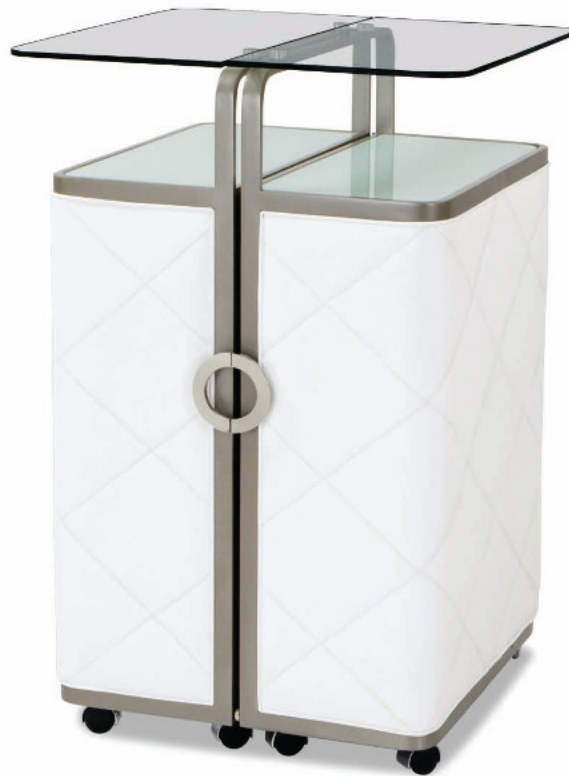
Capri bar, $1,499 at Mobilia.

Modern à la mode: All sleek lines and contemporary glass, white leather and chrome, this rolling drinks cabinet conjures trendy beach-side bars in the South of France. It's called the Capri bar, and hides nine bottles as well as plenty of storage space on glass shelves inside. It's $1,499 at Mobilia, 1872 Merivale Rd.