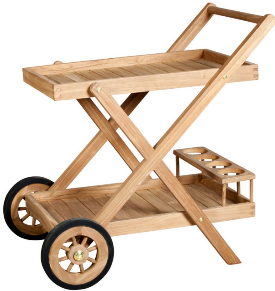
Solid teak cart with brass accents, $229 at Urban Barn.

Island rum: Made from solid teak with brass accents, this handsome bar cart will bring the islands to your garden. It's lightweight and easy to move about, but solid enough to support several bottles and lots of glassware. It's $229 at Urban Barn, 22 York St.